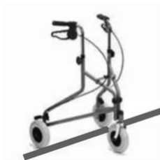
Diagram 2 a